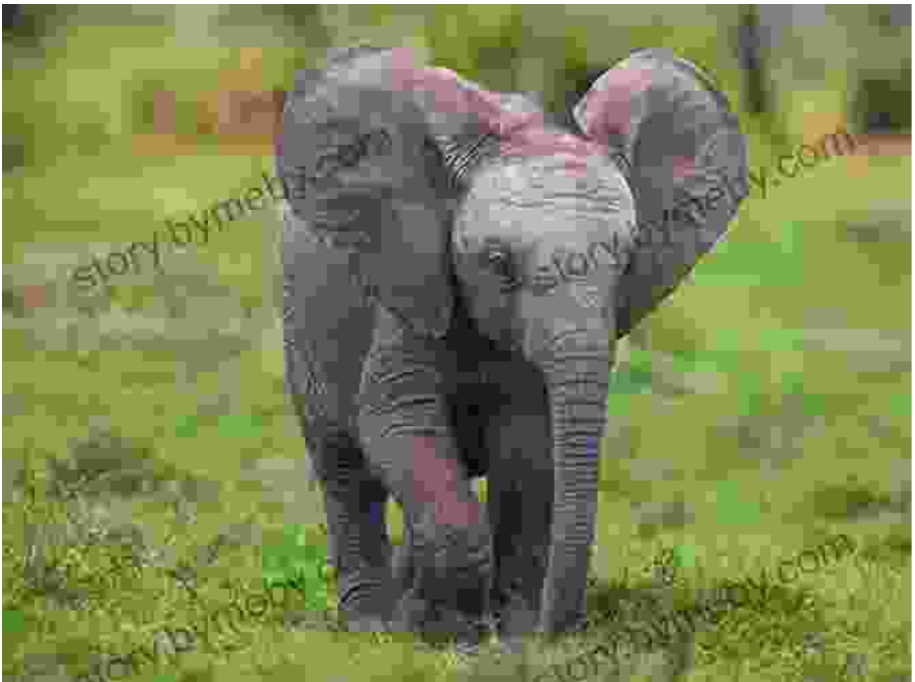
Ellie The Elephant

Prepare to embark on an extraordinary expedition through the vibrant world of Ellie the Elephant, a captivating tale that will ignite the imaginations of young readers. Join Ellie on her remarkable journey as she embarks on a quest to discover the true meaning of happiness and belonging.