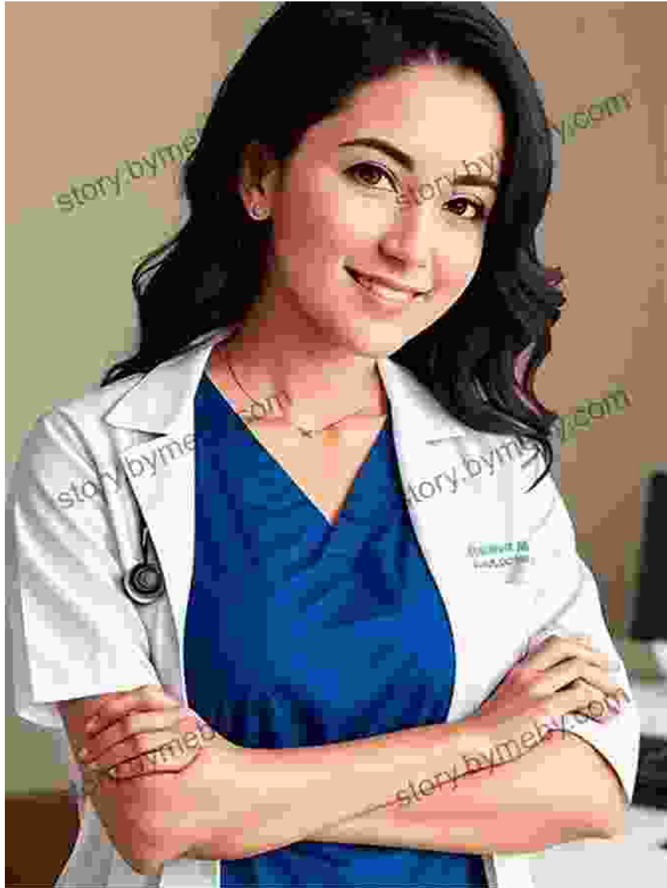
Emily, a doctor with a compassionate expression

Two Generations of Tragedy and Triumph is more than just a story of two women. It is a testament to the power of the human spirit. It is a story that will inspire you to never give up, no matter how difficult life may seem. It is a story that will leave you with a profound sense of hope.