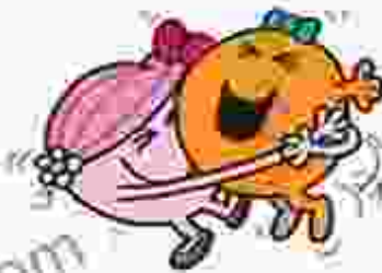
The Jamboree Hug.