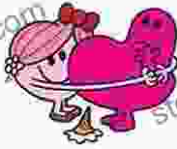
The Big Smoozy.