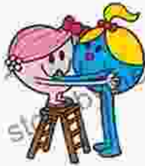
The Body Hug.