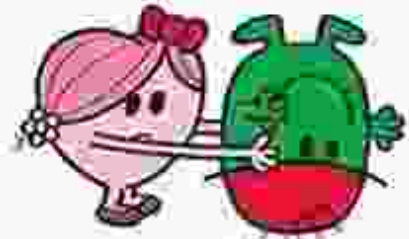
The Cuddly Hug.

This heartwarming tale teaches the importance of surrounding oneself with good friends who uplift, support, and make life's journey more meaningful. It fosters a sense of belonging and empathy, reminding young readers that true friendships are a precious gift to be treasured.