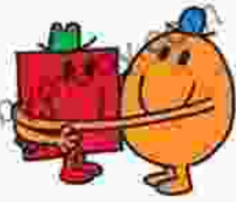
The Bear Hug.