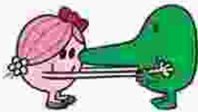
The Cuddly Embrace.