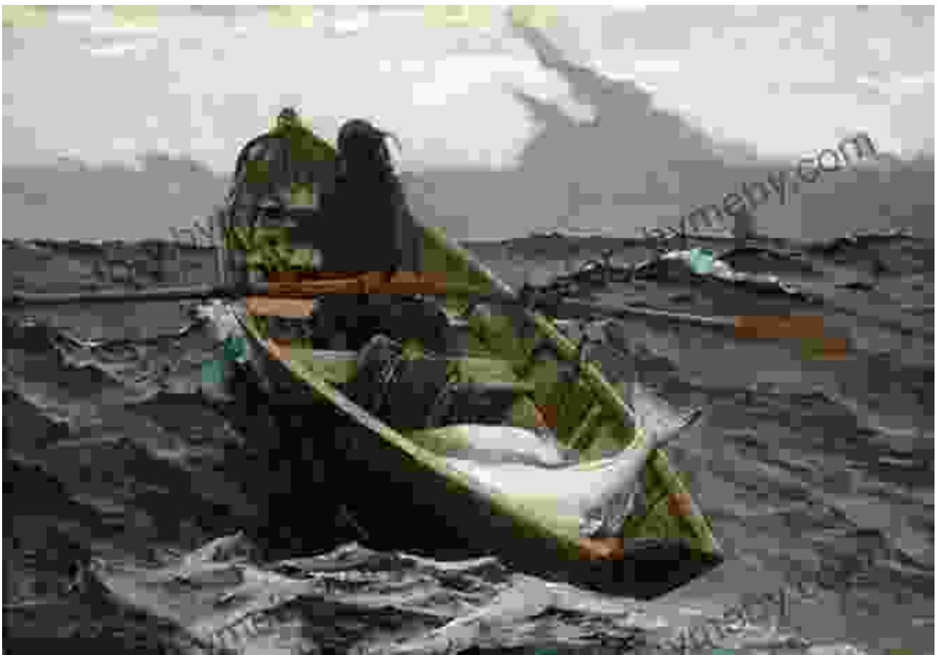
Winslow Homer, The Fog Warning, 1885

For instance, his painting "The Fog Warning" (1885) portrays a foggy morning on the coast of Maine. The muted colors and hazy atmosphere create a sense of mystery and isolation, highlighting the harsh conditions faced by fishermen in this rugged environment.